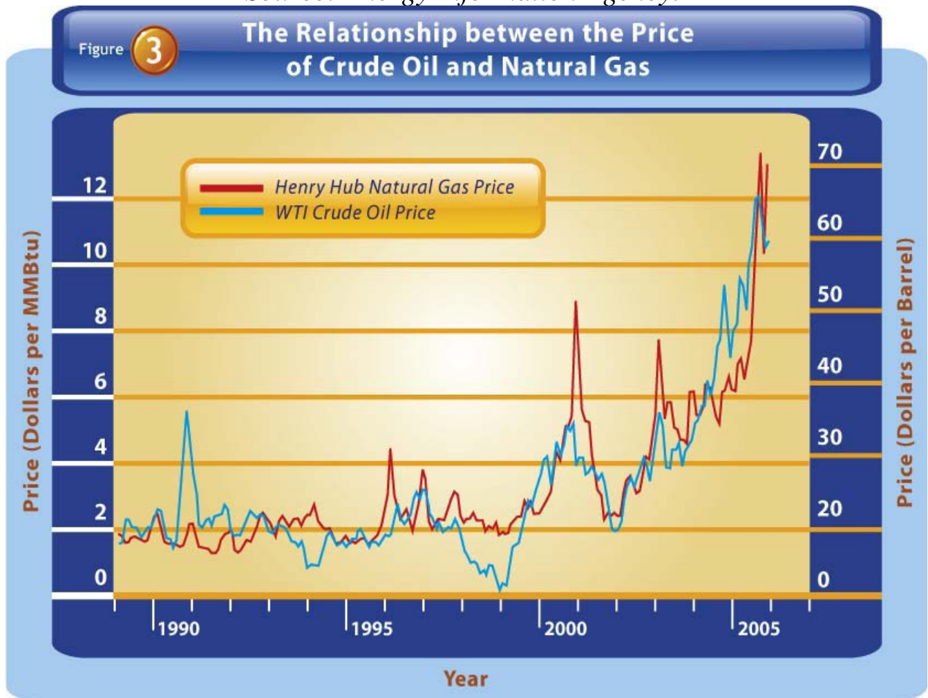
Figure 3 - The relationship between the price of crude oil and natural gas

Beginning in the winter of 2000-01, which was colder and drier than normal, cold weather drove up heating demand, and dry weather reduced the availability of hydropower, increasing the demand for gas-fired electricity. U.S. gas prices that had remained in the range of $1.40 to $2.40 per million British thermal units (MMBTU) for 95% percent of the 1990s spiked to over $6.00 per MMBTU in late 2000. 8